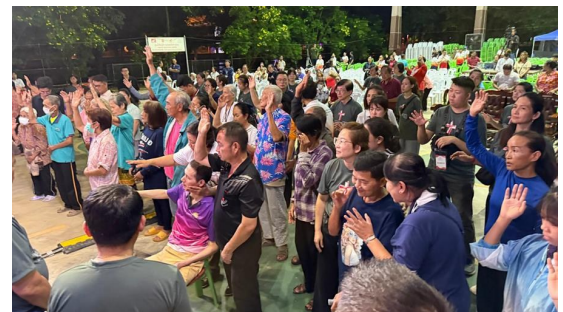
Outreach event in Thailand

The generosity of UK churches and individuals has also enabled 6,396 forcibly displaced people to receive help while in transit and equipped 491 workers to support and welcome new arrivals across Europe. The consistent compassionate giving of UK churches has made it possible for us to assist 603,556 people affected by disasters in multiple locations around the world.