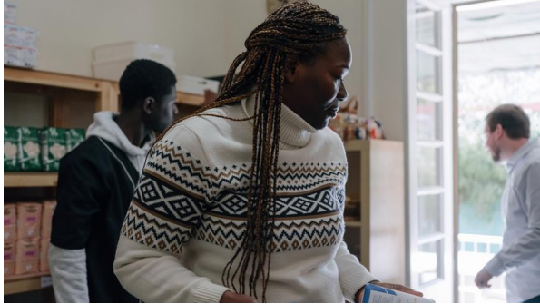
Volunteers at a welcome centre for refugees in Cyprus

I want to thank you so much for your generosity in supporting BMS World Mission over the last year. In 2025 Carey Memorial Baptist Church gave £1,000.00. We appreciate that for many churches, your giving to BMS is sacrificial at a time of limited resources and multiple competing demands. Your faithful giving is greatly appreciated, and we are working hard to maximise the Kingdom impact of your gift.